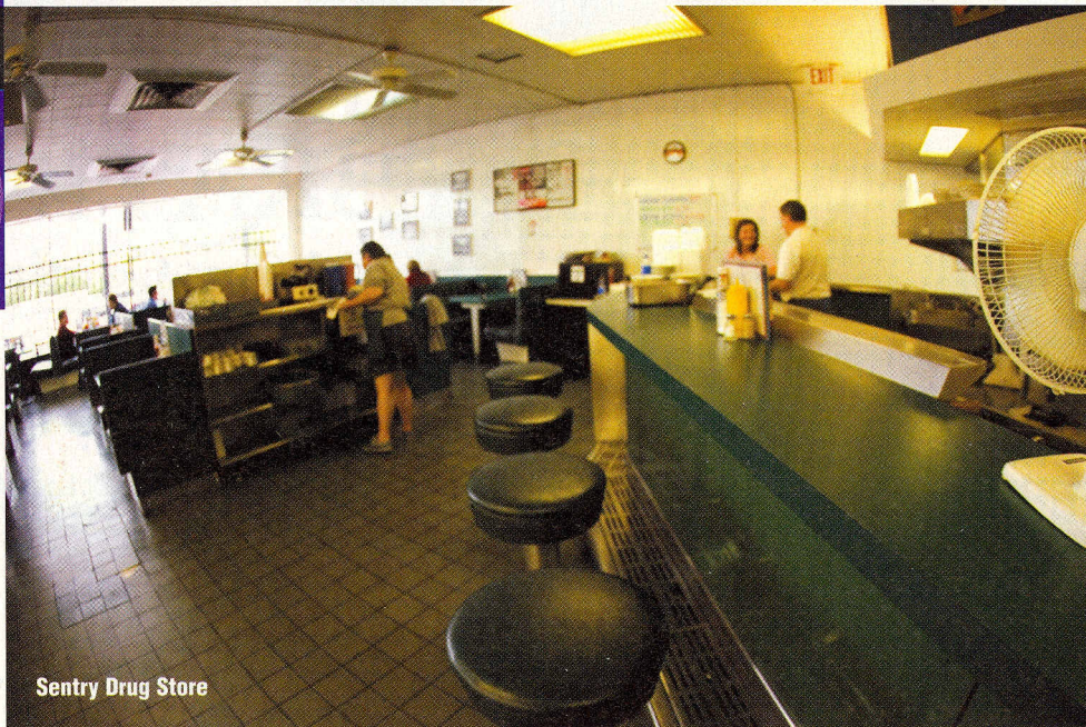
Sentry Drug Store

Nostalgic lunches abound. Miss Linda's burgers are jaw-achingly generous and the old-time club sandwiches are perfectly layered triangles complemented by crispy bacon and cheese. Swiss or cheddar