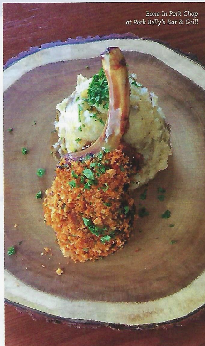
Bone-In Pork Chop at Pork Belly's Bar & Grill

St. James Place offers something unique that can't be found at other senior living communities in Baton Rouge: vibrant Independent Living and access to a full continuum of on-site long term care, including Assisted Living, Memory Care, Rehabilitation and Skilled Nursing Care. To learn more about St. James Place, enjoy an educational luncheon, take a tour, or arrange a personal appointment by calling 225-910-8305.