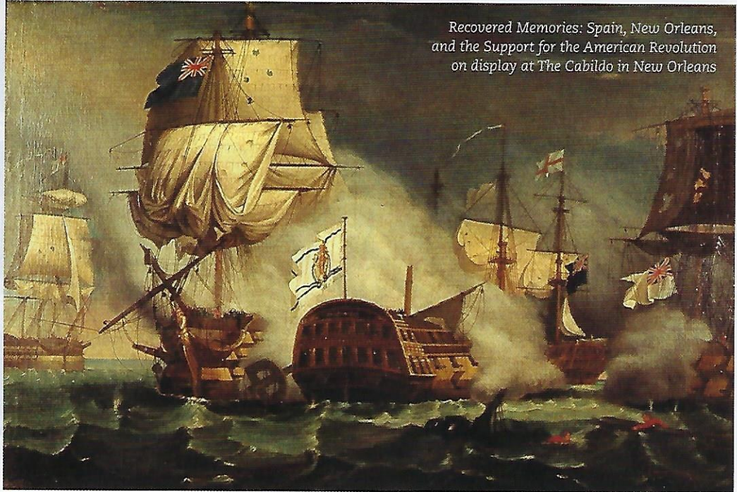
Recovered Memories: Spain, New Orleans, and the Support for the American Revolution on display at The Cabildo in New Orleans